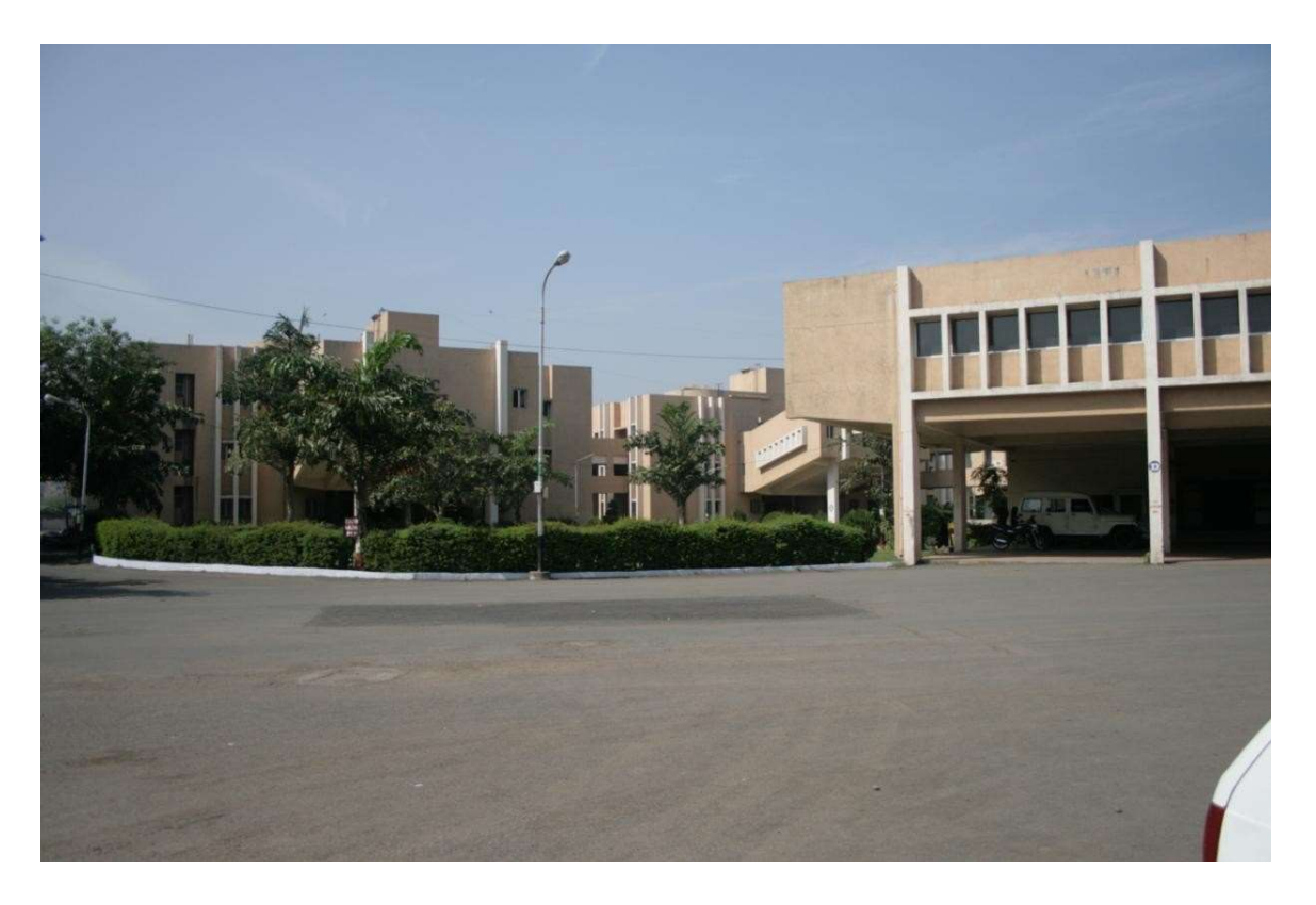
SURAT MUNICIPAL INSTITUTE OF MEDICAL EDUCATION AND RESEARCH